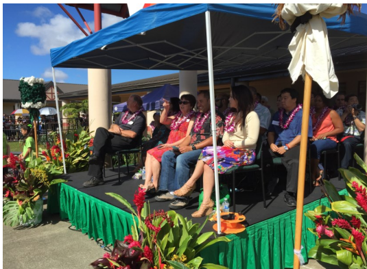
Senator at Mililani Ike May Day Program

NOAA Weather Radio— http://www.nws.noaa.gov/nwr/