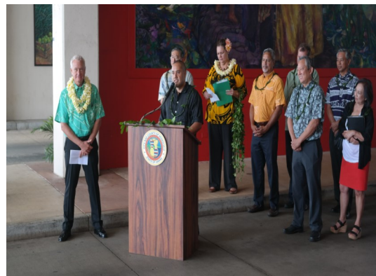
Senator speaking at the Dedication of Murals at the Wahiawa Transit Center.